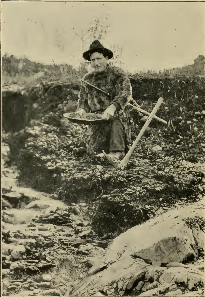
WASHING GOLD AT POINT BARROW, ALASKA